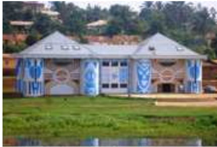
Musée des civilisations in Dschang (Main facade)