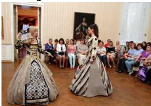
Theatrical Performance