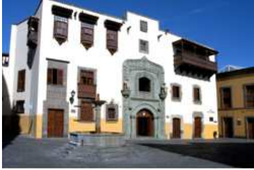
Facade of the Casa de Colón, Square of the New Pillar