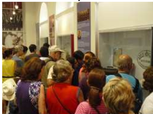
Visits at the MUHM