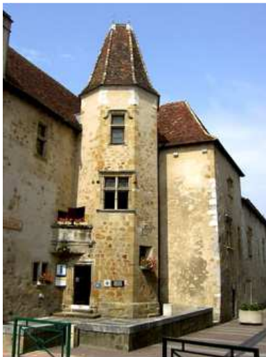
« Maison Jeanne d'Albret »

Visit of the museum's bookbinding workshop (14:30 - 17:30) Visit.