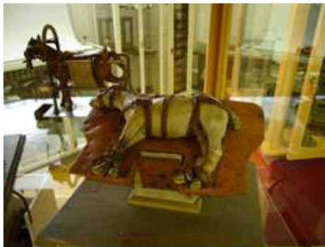
1914 Operation Schneider Bed model

Military veterinary historical material (Monday to Friday from 9.30am to 2pm. For groups, arrange a visit)