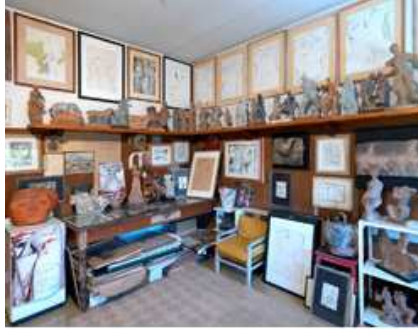
Studio of the Museo Ugo Guidi