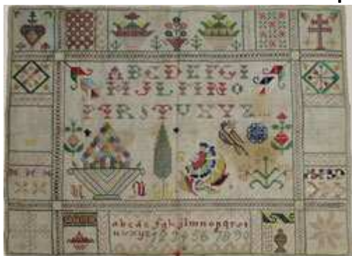
Collection textile pedagogical