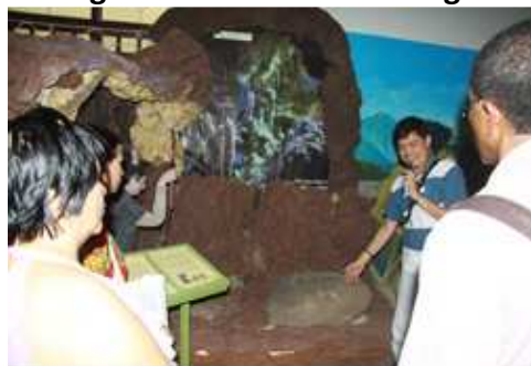
International Museum Day in Sorsogon