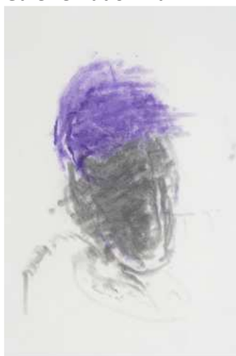
Adriena Šimotová: From the cycle Heads – Head in the wind, detail, 2009, graphite, pastel, pigment, 100x70 cm