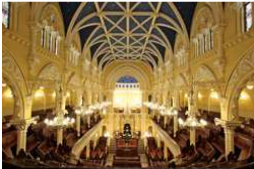
Interior view of The Great Synagogue, Sydney.