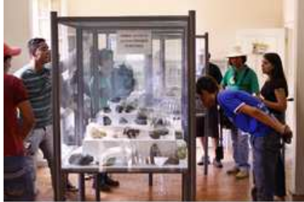
Activities of the Museu de Ciências da Terra Alexis Dorofeef.