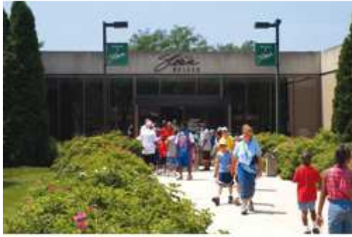
Sloan Museum is a place for families to have fun !