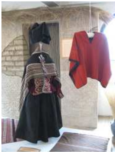
Traditional dress aymara de mama thalla. Region Aroma, dept. La Paz, Bolivia.