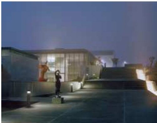
Nighttime view of the Israel Museum's new gallery entrance pavilion from Carter Promenade, including Claes Oldenberg and Coosje van Bruggen's "Apple Core" and Anish Kapoor's "Turning the World Upside Down".