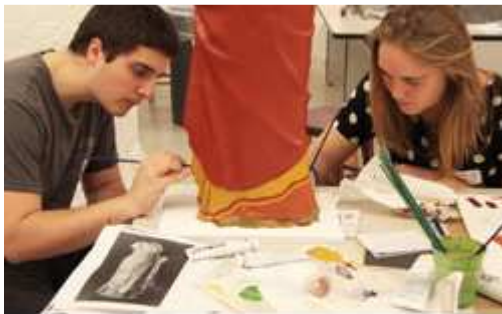
Stanford students work on a replica sculpture for True Colors: Rediscovering Pigments on Greco-Roman Marble Sculpture.