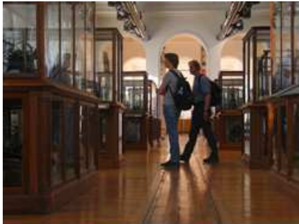
Visitors at the Musée des Arts et Métiers

Discover first-hand the collections at the musée des Arts et Métiers (12am, 2.30pm, 2.45pm, 5pm)