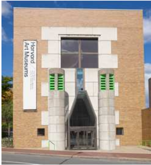
Harvard Art Museums. Arthur M. Sackler Museum, Cambridge, MA.