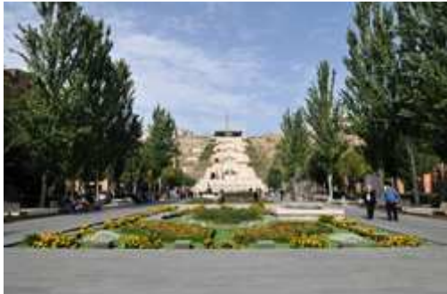
Cafesjian Center for the Arts