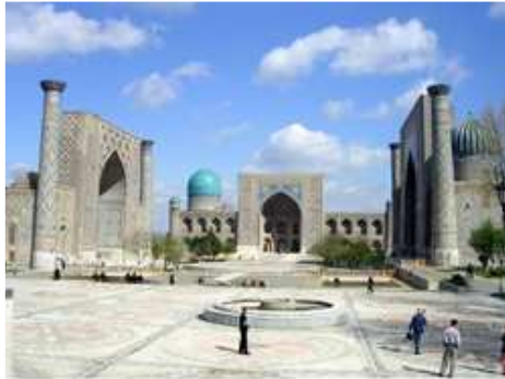
Registan Square - the ancient forum of Samarkand.