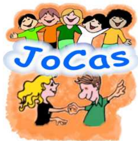
Logo Historisch Museum JoCas.