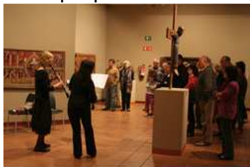
Museum night at the Museu episcopal de Vic

Museu Episcopal de Vic International Museum Day Activities (from Saturday 14th until Wednesday 18 th )