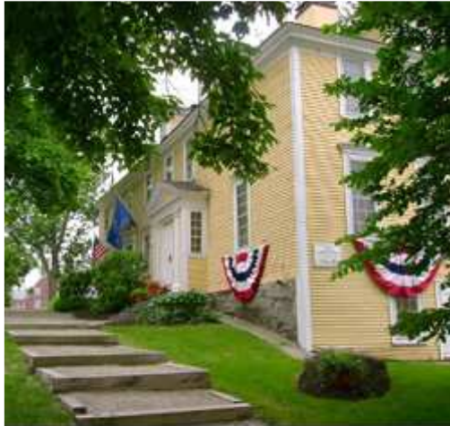
The Ladd-Gilman House, c. 1721, one of two buildings comprising the American Independence Museum which tells the story of America's struggle for freedom and its founding.