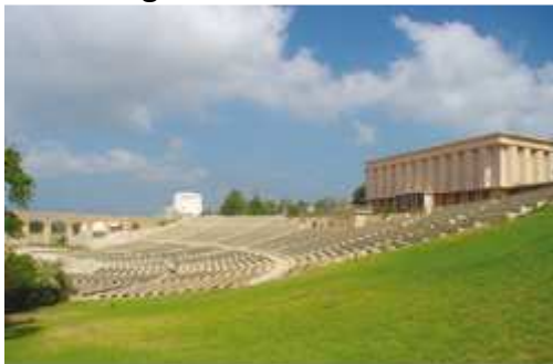
Ghetto Fighter House: © Ghetto Fighter House