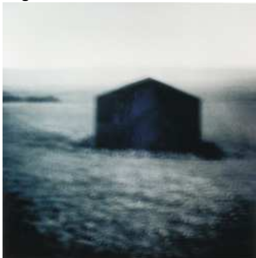
Michal Rovner, Outside , no. 17, 1991. © Michal Rovner