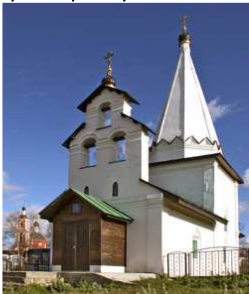
Lytkarinsky Museum