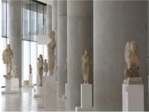
Exhibition space at the New Acropolis Museum, Athens, Greece.

Exhibition: "...constructing memory while reconstructing museology".