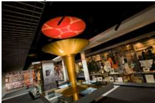
The 1956 Melbourne Olympic Games Cauldron in the Faster, Higher, Stronger Gallery of the National Sports Museum