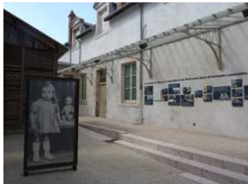
Cercil Museum Courtyard - Mémorial des enfants du Vel d'Hiv