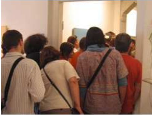
Exploring contemporary art in the museum.