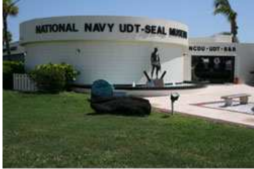
National Navy SEAL Museum