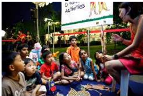
Singapore Peranakan Museum