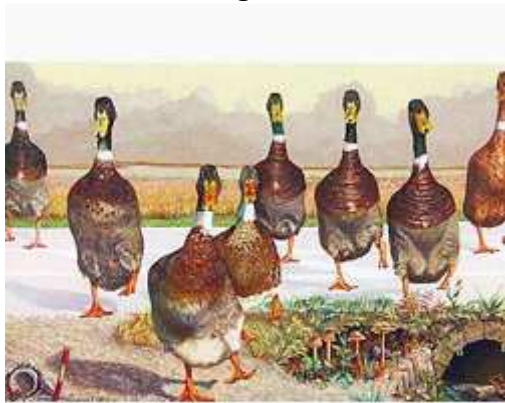
Runnerducks: oil by Sulpicius Bertsch