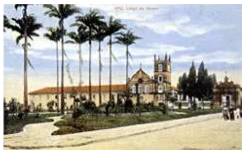
Carmo Church, Itu-SP, Brazil - Century 18 (postcard, 1910)