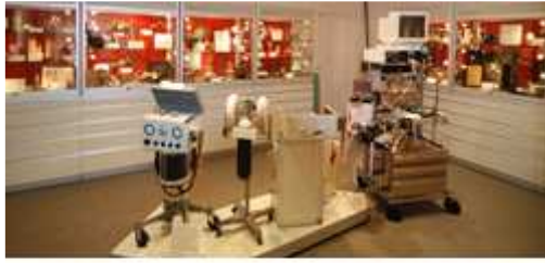
The Harry Daly Museum at the ASA Headquarters.