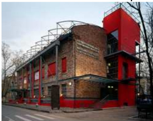
The building of the NCCA, Moscow