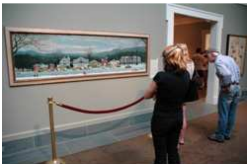
Norman Rockwell Museum visitors view Rockwell's painting, Golden Rule © 1961 SEPS : Licensed by Curtis publishing, Indianapolis, IN.