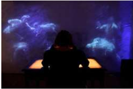
Museo Laboratorio della Mente