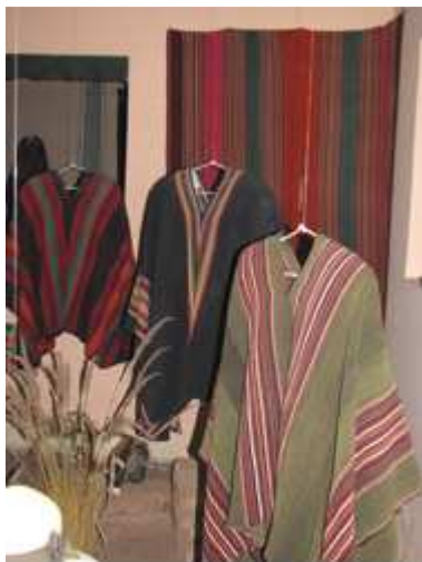
Ponchos of the central región of the country. Dept. Potosí