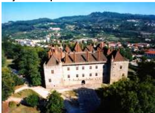
Paço de Duques