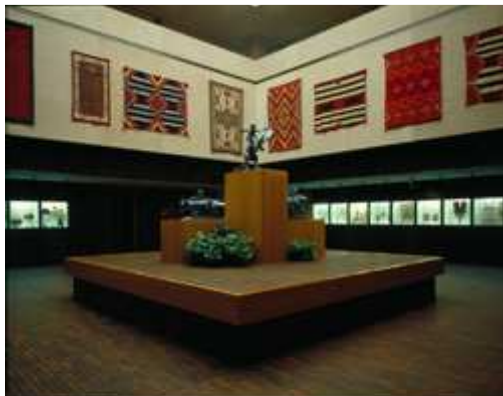
Lobby, Stark Museum of Art, Orange, Texas, USA.