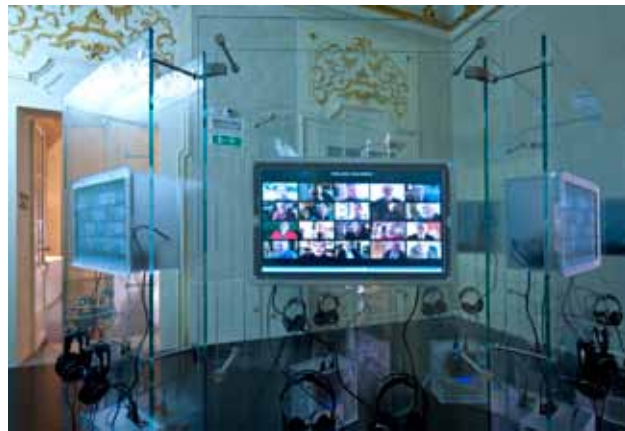
Famous people speaking