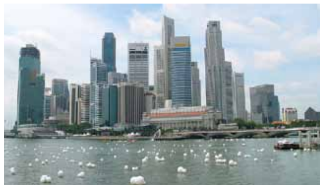
Singapore, one of the top networked cities.

Which begs the question: are city museums smart or dumb? What are the opportunities for city museums in the Networked Society? The most important issue I see so far is that the Networked Society will change how our content is produced and packaged. Right now, many →