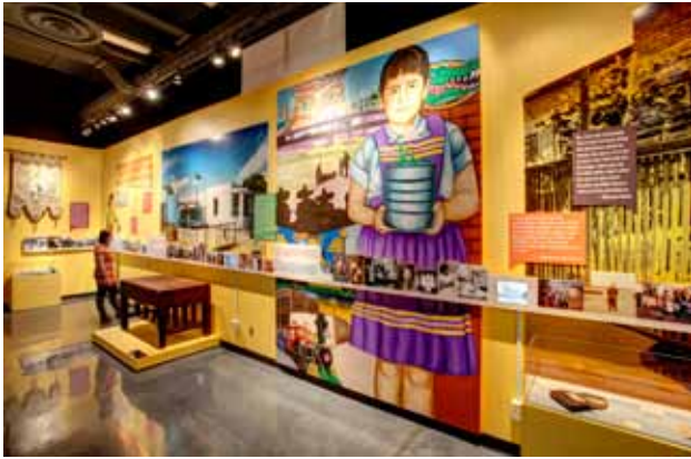
Chihuahuita neighbourhood exhibit area: a mural, wall graphics, display cases, and digital photographs

“I think it’s good to remember where you came from because it lends support to how you live the rest of your life”***