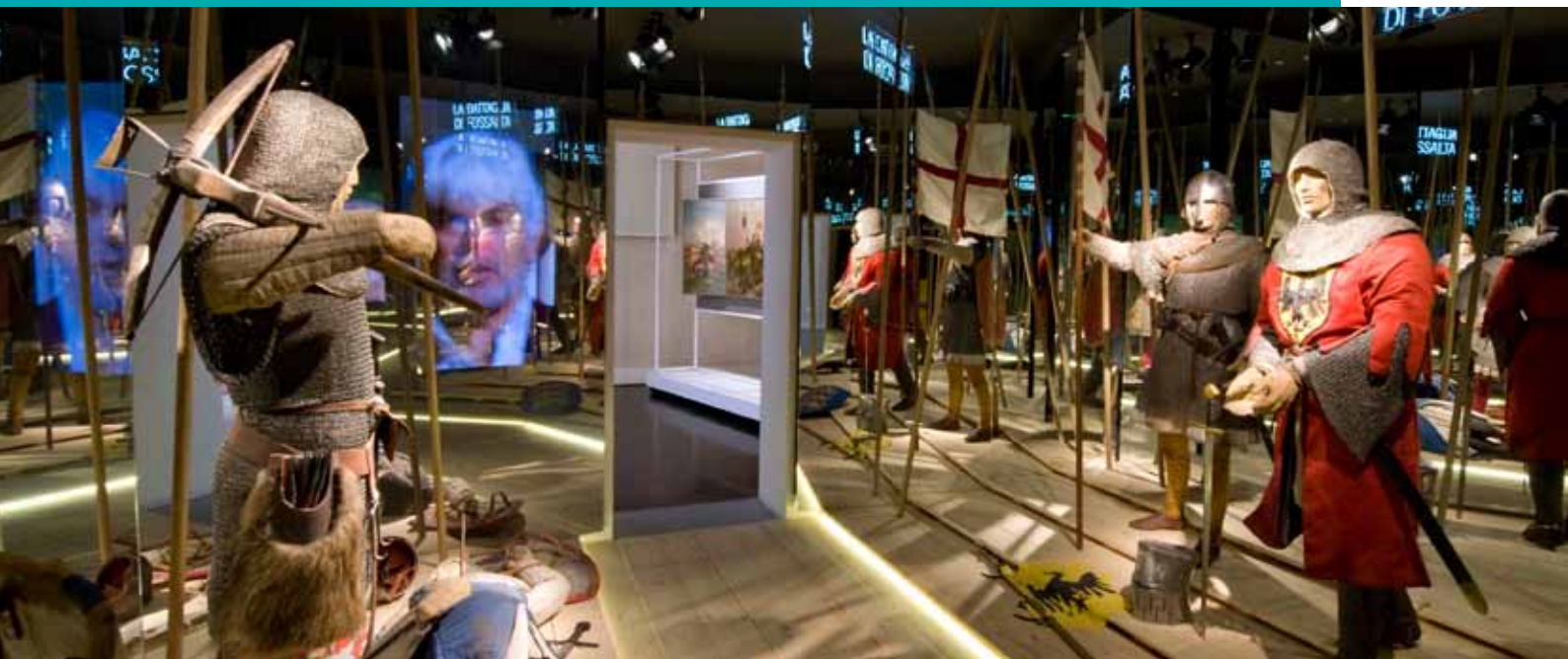
Battle of Fossalta