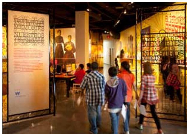
Iron gate leading to the Neighbourhoods and Shared Memories exhibition

Three Collection Day events were held between December 2009 and May 2010. The public was invited to bring their photographs and special mementos to share with museum staff and the public. Photographs were scanned and the curator examined artefacts as volunteers recorded stories, family histories, and anecdotes. Since November 2009, the exhibit project collected more than →