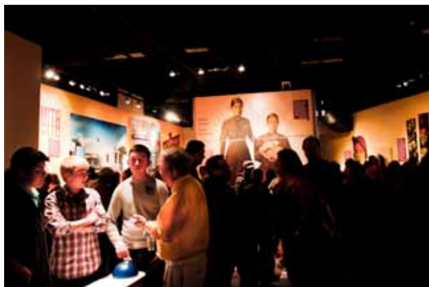
Discussion around the Spin-browser during the Grand Opening: an animation of the regional settlement

700 photographs, identified more than 60 artefacts, recorded 20 hours of oral history interviews, and close to four hours of video interviews. These elements were woven together to explore the themes selected by the initial planning group.