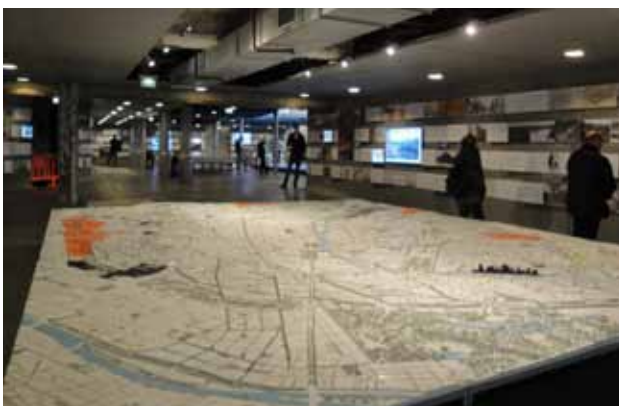
The main exhibition hall

A new exhibition at the Pavillon de l'Arsenal, the Paris urban history exhibition centre.