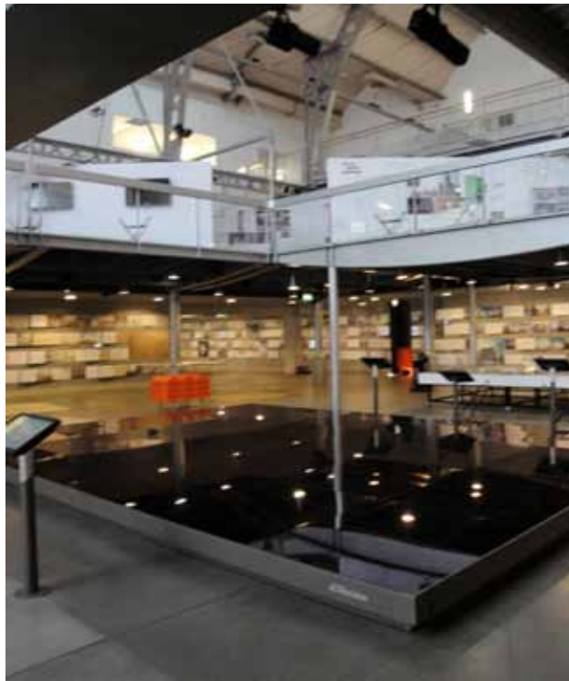
Paris Metropolis 2020 Digital Model

A 37 metre square digital model allows navigation in high definition across the city and its urban surroundings. This innovative experience introduces us to the main challenge of redesigning the Paris metropolis on a larger scale - from Le Havre on the Normandy coast down to the local urban area. More than 1,200 on-going development projects are presented, such as the Fondation Louis Vuitton for Creation in the Bois-de-Boulogne by Gehry Partners, scheduled to open in 2013, or the small-scale housing renovation project of the former MacDonald warehouses in the north-east. The digital model can also be remotely accessed. ■