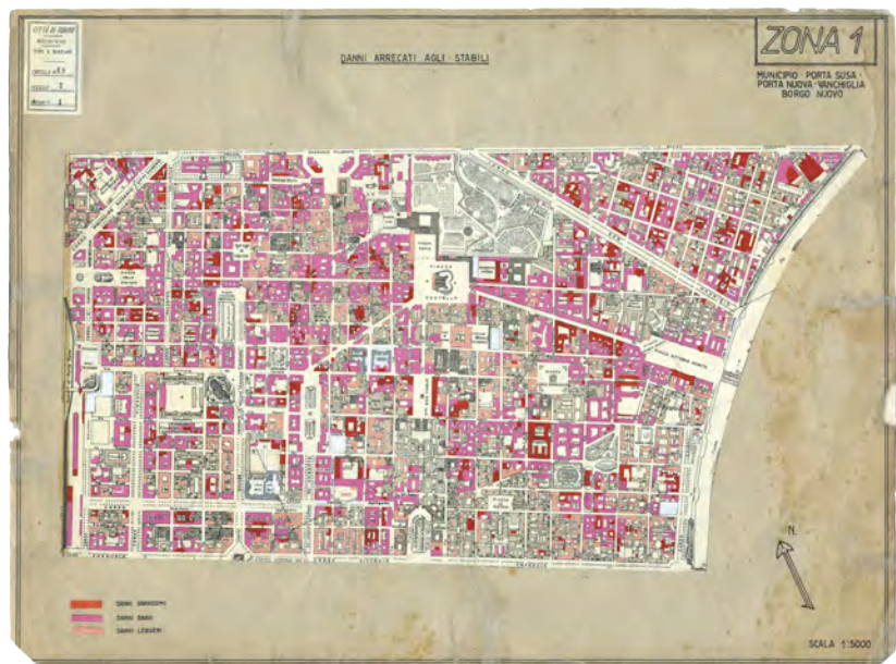
Damage to buildings 1:5000, 1942-1945. Zona 1: Municipio, Vanchiglia, Porta Susa, Porta Nuova, Borgo Nuovo. ASCT, Tipi e disegni, cart. 68, fasc. 2 disegno 1.

clearly shows the extent of the bomb damage sustained by Turin. Comparing photographs taken just after the British and U.S. air raids to the same places today, we see an unrecognizable and at times non-existent city: torn apart by bombs, cloaked in a white veil of phosphorus and