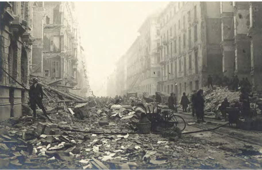
Turin, Via Luigi Cibrario. Effects of the bombing raid on 8-9 December 1942. UPA 2772_9C06-33.

the Reciproca Solidarietà e Lavoro Accessorio program of the Compagnia di Sanpaolo, a Turin-based foundation. The foundation's initiative is designed to supplement the income of families in need, to reinforce the local community's sense of belonging, and to ensure resources for additional community services.