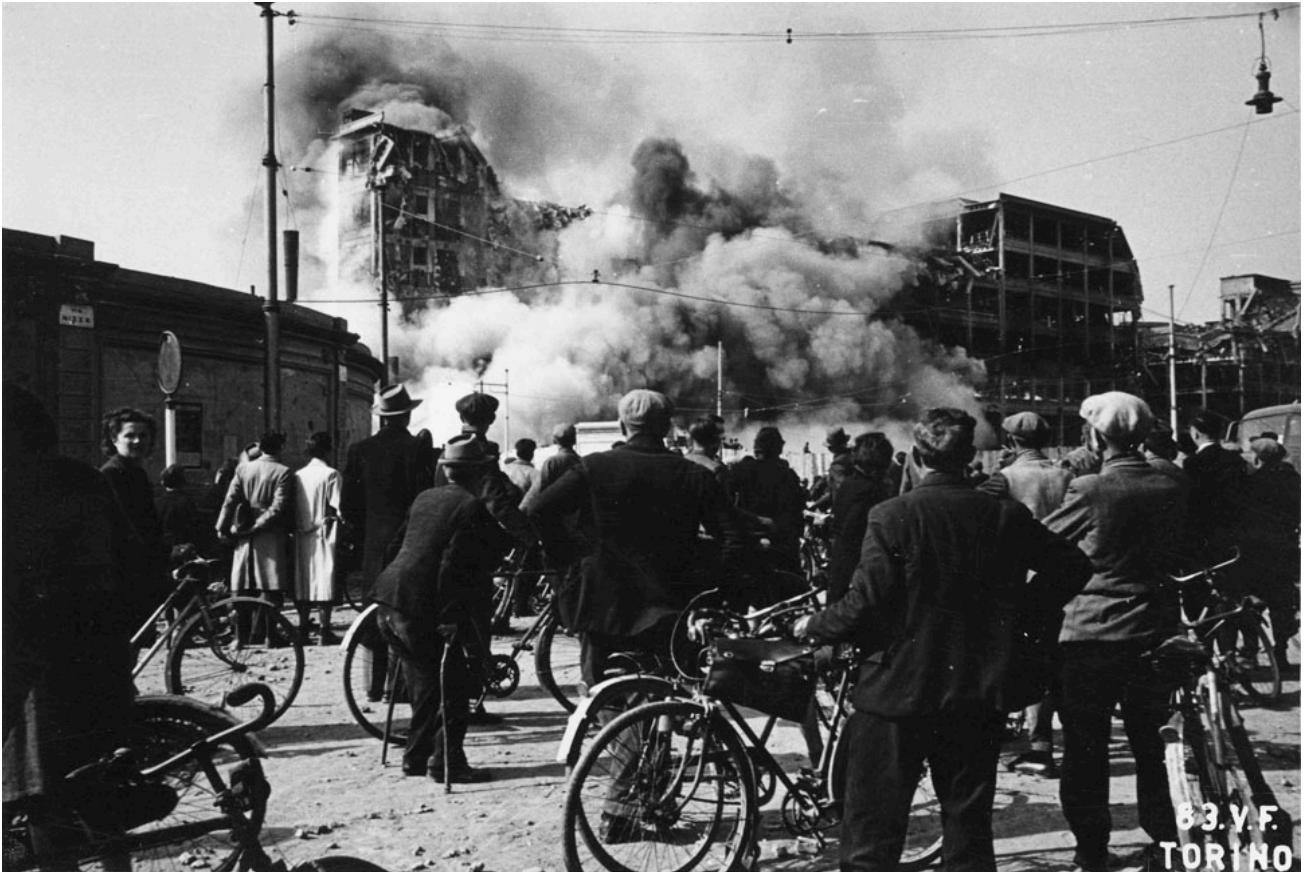
* Turin, FIAT Lingotto. Effects of the bombing raid on 29 March 1944. UPA 4429_9E05-59.

2015 brings with it both the 70th anniversary of the Liberation of Italy (1943-1945) and the centenary of Italy's entry into the First World War. These two important anniversaries call for a particularly significant commitment by public authorities, partisan associations, and by institutions that study the history of the twentieth century and promote memorial sites.