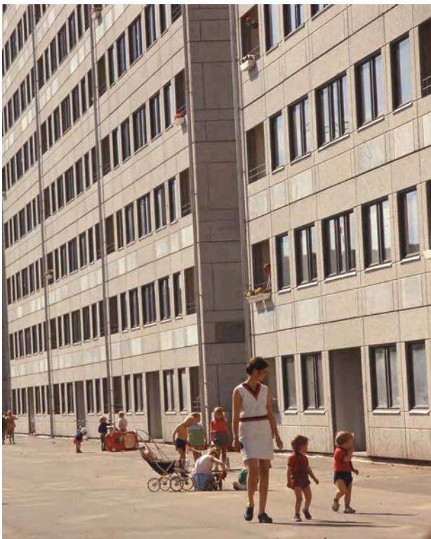
Gothenburg suburb in the 1970s.

"Industrialization", then, is a broad concept which contains within it different meanings. In a strictly economic sense, the word implies an increase in the proportion of industrial production and employment to the rest of the economy. For those interested in technology, it implies technical