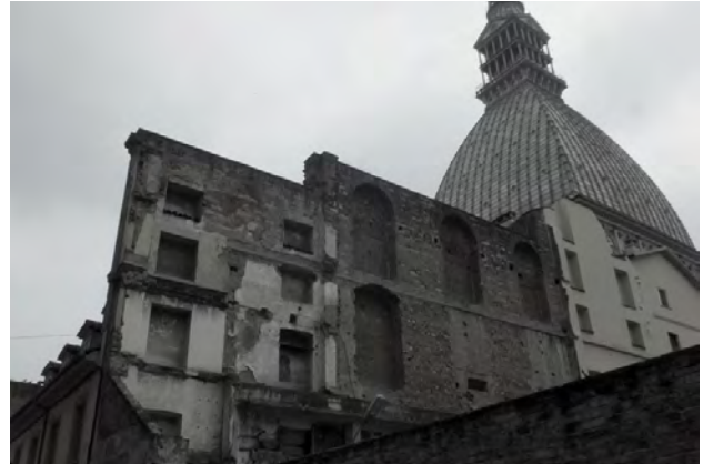
Teatro di Torino, bombed on 8 December 1943. The Mole Antonelliana in the background. Photo: Paola Boccalatte, 2013. © MuseoTorino

The museum of the City of Turin has thus attempted once again to relate to the urban landscape and its transformations, offering a model of a museum in which people may share and take part. It is, however, still struggling to overcome the limitations of being a purely “virtual” site, and its creators continue to work to gain the full