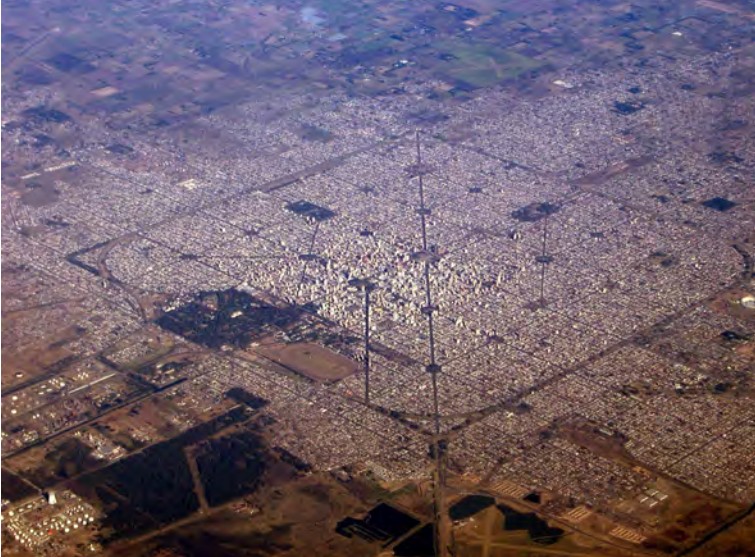
La Plata seen from the air.

In today's globalized world, large cities are centres that concentrate most of the world's population, rapidly growing in density and size and attracting regional and global migration. They are complex organizations, cosmopolitan, with particular characteristics according to history, population, culture, geographical location and environment. Many have established themselves as economic and political centres of global importance, as cultural centres and as tourist destinations, whether because of natural or man made beauty or important historical events.