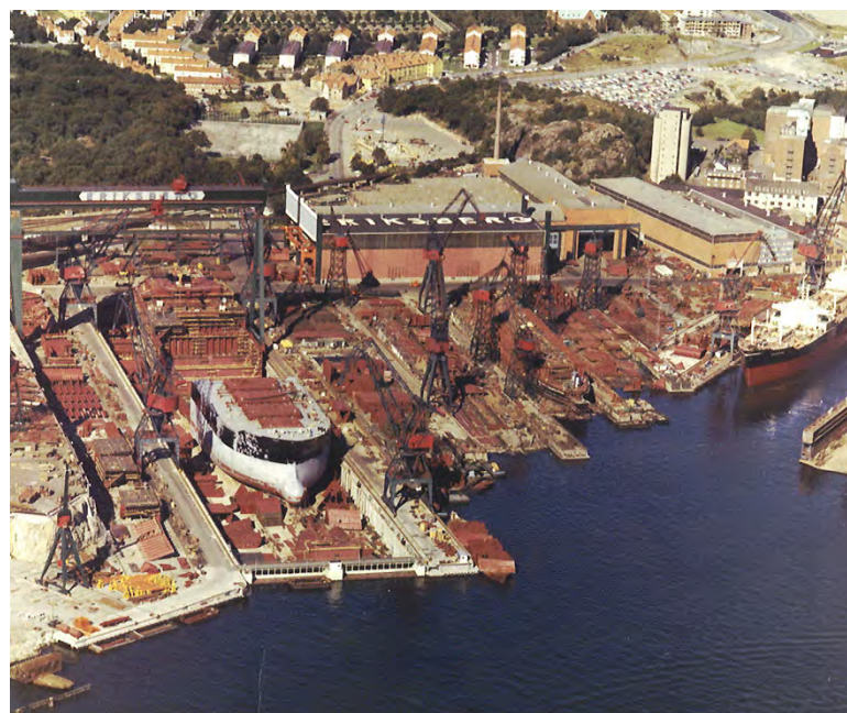
Erikbergs Shipyard in 1971.

“We” is a key word in this context, as it implies membership in a legitimately democratic society. It is not easy to contribute to creating the future if you do not understand your own history. A basic assumption of our work is that everybody has knowledge, that everybody can understand knowledge, and that everybody produces knowledge. By documenting and analysing the transformation of the industrial society in the Västra Götaland Region, we hope to raise awareness, both locally and globally, that contributes to the democratic process of reflecting on the past and shaping the future.