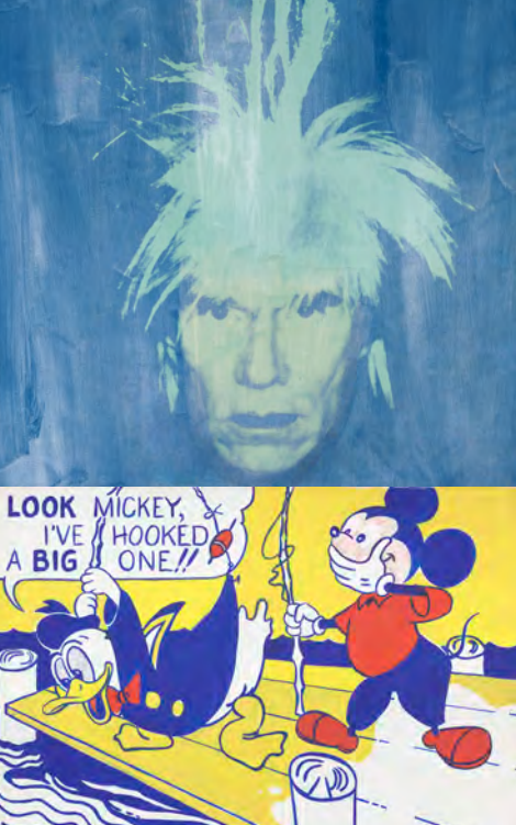
Back Light Self-Portrait, Andy Warhol. Look Mickey, Roy Lichtenstein.