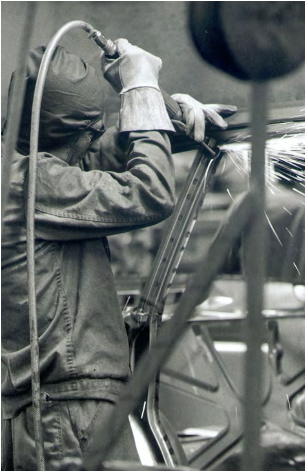
Volvo car manufacturing plant in the 1970s.

Sweden's cultural and economic shifts over recent decades have, according to some researchers, also influenced people's way of thinking. During the industrial era, Swedes relied more on organizations. In today's consumption-oriented society, public confidence relies more on people and networks. Even as work has become more distinct, the workplace is losing its importance in creating collective identities. These changes apply, as well, to our patterns of thought and our conception of the world.