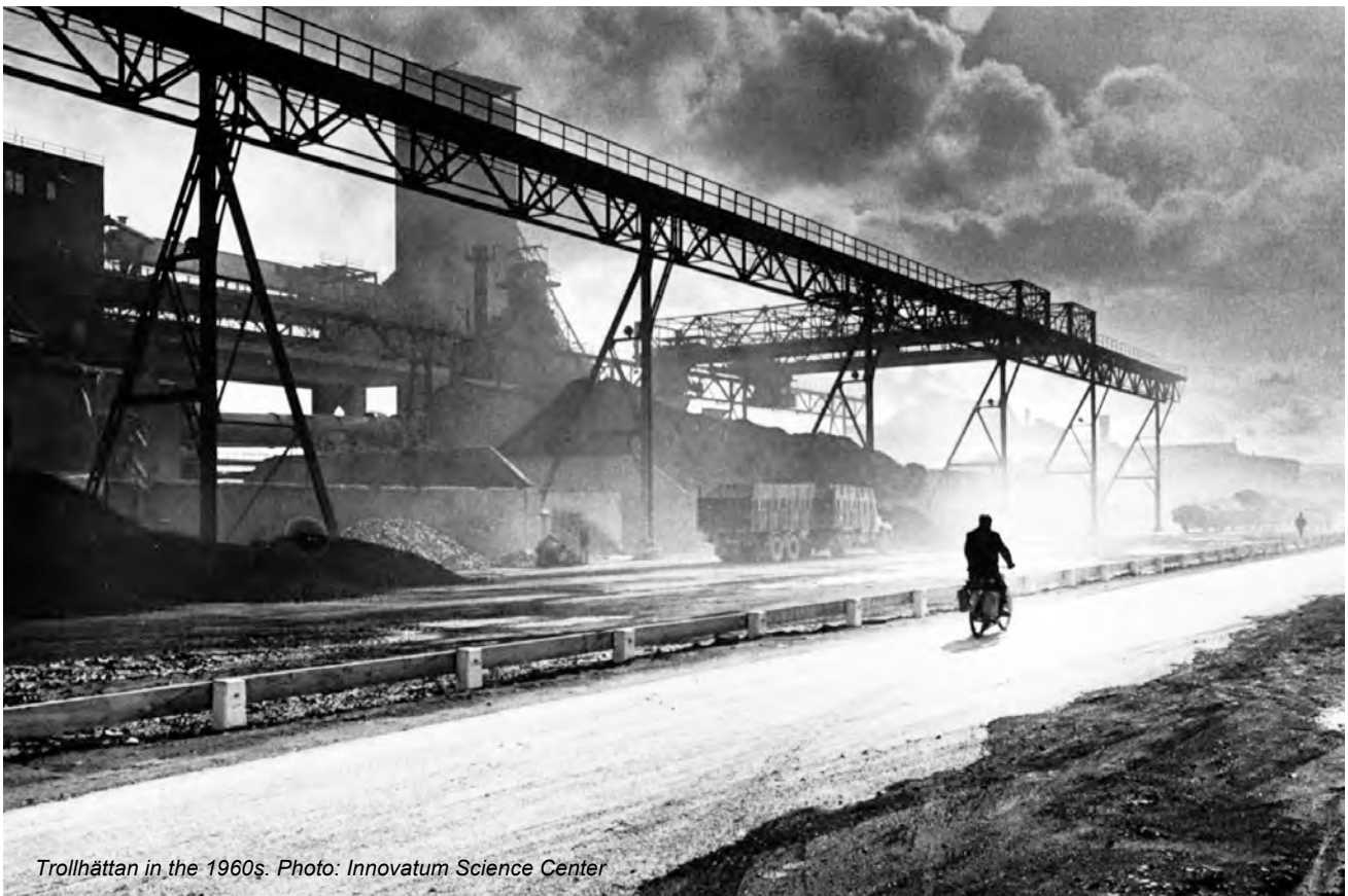
Trollhättan in the 1960s.

In recent decades, the cultural history museums in Sweden's Västra Götaland Region have documented a number of factories and workplaces. Collecting objects as well as archival materials, interviews, and photographs that bear witness to