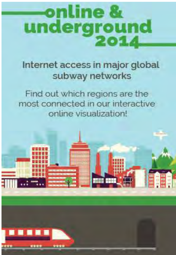
Internet access in major global subway networks. http://www.newcitiesfoundation.org/online-and-underground-2014/

website of the city's leading newspaper, The Dallas Morning News. Via social media, the Summit reached an even greater audience, with 3.8 million people reached through more than 1,300 media interactions from Summit participants.