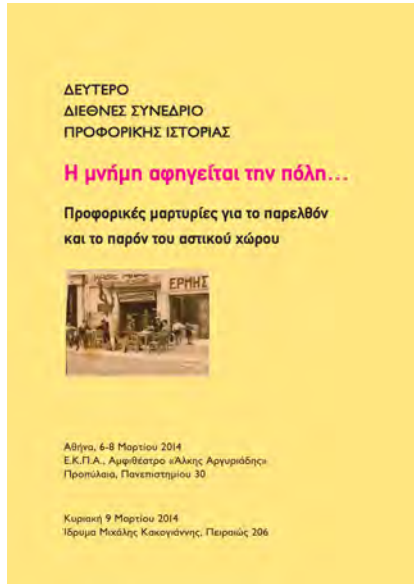
Poster of the conference.

Abstract of the inaugural speech in the conference Memory Narrates the City. Oral Testimonies about the Past and the Present of Urban Space , Athens, 6-9 March 2014. The Memory Narrates the City conference was co-organized by the Greek Oral History