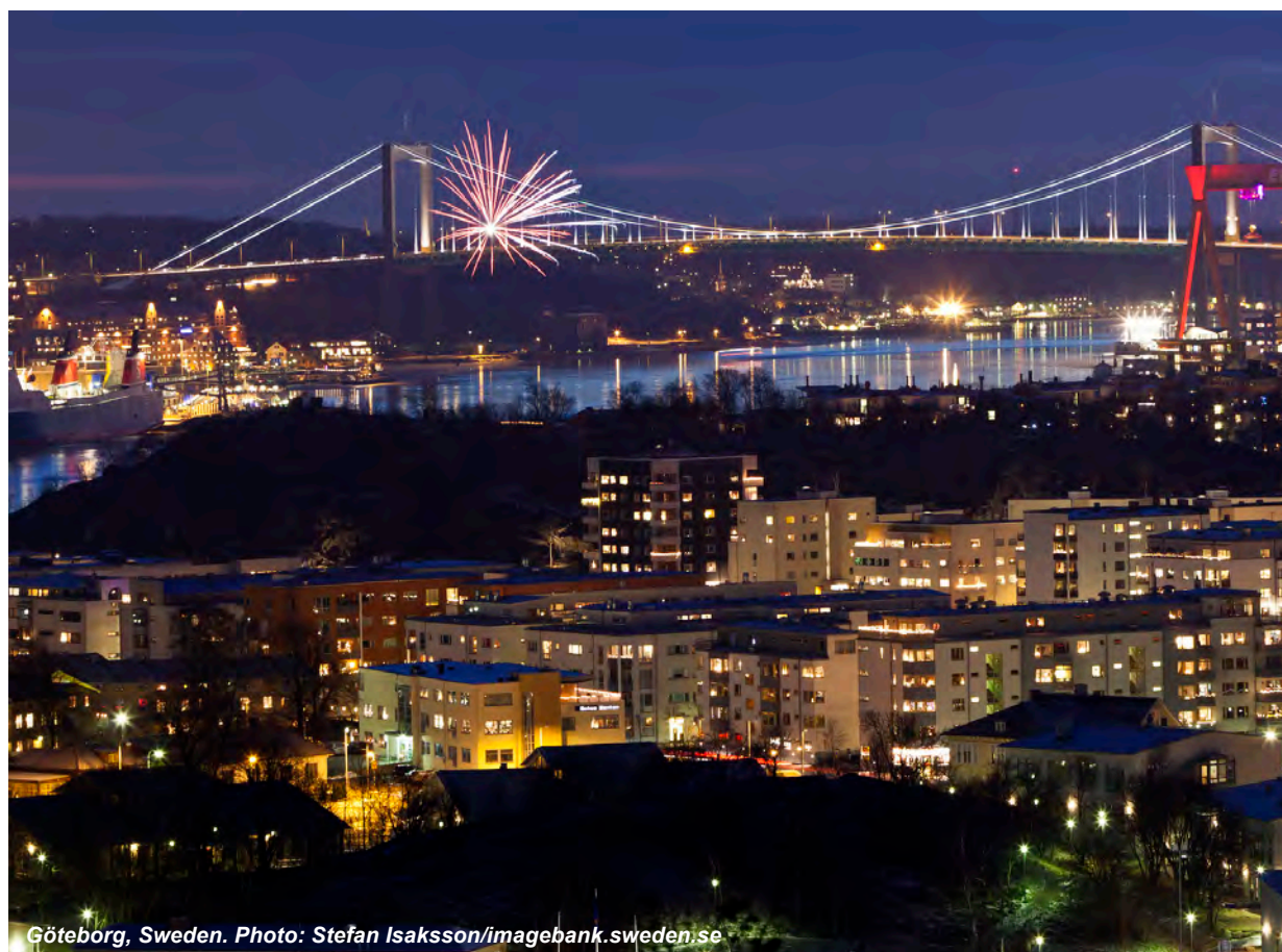
Göteborg, Sweden.

INDUSTRIAL HERITAGE, SUSTAINABLE DEVELOPMENT, AND THE CITY MUSEUM