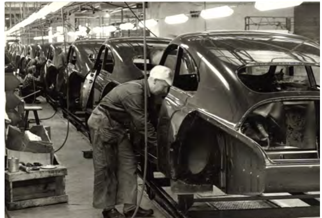
Saab car manufacturing plant in the 1960s.

advancement, as when new power sources and engineering techniques come into use. A third meaning of the concept involves organizational changes and altered social conditions that extend beyond the workplace to affect an entire community. Indeed, the phrase "industrial society" gathers these three meanings under a single rubric.