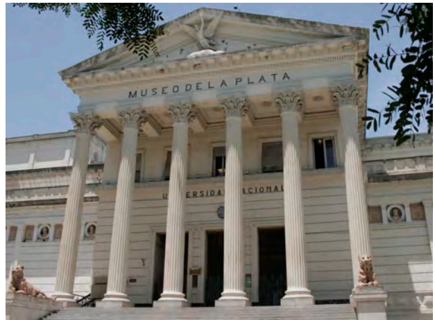
Museum of La Plata.

La Plata, since its foundation, and even from its conception as a planned city, has the fundamentals of being a project or alternative designed for a healthier and more ecological living. It was the most modern city of its time. The geometric perfection of its layout was praised