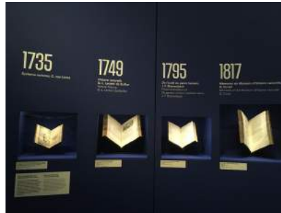
The history of racial thinking is developed chronologically in one room. Musée de l'Homme.

history of racial investigation of the founding figure of its collections, while debating racism? And, accordingly, what is the responsibility of a museum regarding human remains collections, and their history?