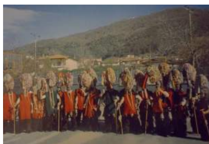
The traditional costume and the bells

elements from Christianity. For that reason, I took the initiative to go on a research field trip to Sohohs. The carnival is distinct from other carnivals in the area mainly because it combines the traditional dance and singing with the unique sound of the metal bells, which the Koudounoforoï wear as part of their disguise (see photograph 2).