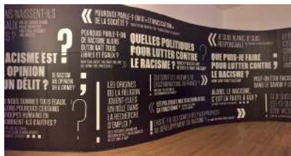
Us and Them, from Prejudice to Racism. Musée de l'Homme.

On 31 March of this year, the Musée de l'Homme in Paris opened its first major exhibition since its reopening in 2015: Us and Them, from Prejudice to Racism . A highly interactive exhibition, it questions understandings of differences, through various intellectual, geographical and historical prisms. The reopening of the museum has divided opinions: its spacious, contemporary and interactive design has attracted new visitors, but the choices in narratives – which has left aside the historical past of the museum – and its emphasis on technological devices as formats of engagements, has led to some calling it, 'a very un-human museum.'