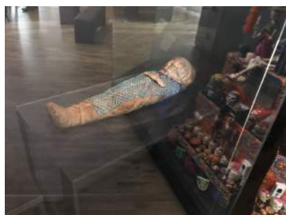
Mummy of a child, Ptolemaic period, Musée de l'Homme.

engagements with Egyptian mummies which involved racially-motivated dissections, collections and studies. The legacies of these practices exist in museums around the world (to name but a few: the British Museum and the Musée du Louvre hold such legacies in their collection). The cultural history and object biographies of collections of human remains – and the important cultural and historical implications they hold – remain to be told: removing collections from display does not erase the complicated racial history of museum collections, and museums have not yet engaged with the intricate history of mummy collecting, which extends far beyond simple Egyptomania.v Museums too often shy away from the complex history of their collections: a museum like the Musée de l'Homme (and the MNHN) is not a racist museum, it is a museum with a racial history; it is not responsible for the racial lenses through which its collecting activities were developed, but it is its responsibility to engage with the history of its collections. Us and Them is a first step in acknowledging a history of racial thinking and collecting, but the Museum has not yet engaged in linking this historical narrative to the collection it holds in trust.