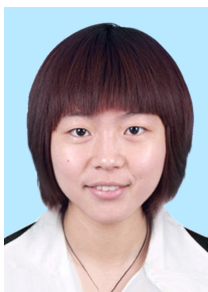
Tan Yao Publicity and Education Department