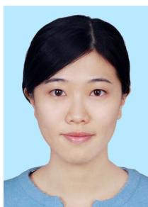
Li Yingchong Publicity and Education Department