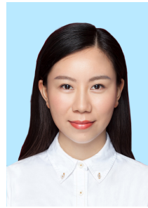
Xie Shuo Chongqing China Three Gorges Museum Public Education