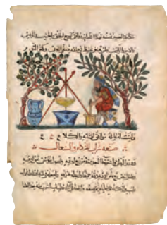
4. Paper folio with ink, gold and opaque watercolours from a Materia Medica of Dioscorides showing a physician preparing an elixir, possibly from Baghdad, AD 1224, 33.2 x 24.8 cm.