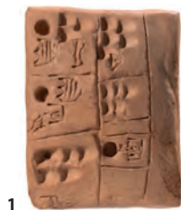
1. Clay tablet with cuneiform writing, Uruk, ca. 3200 BC, 5.7 x 4.3 cm.

Manuscripts, books and documents: Codices, Qur'ans and scientific texts. Paper or parchment, with Aramaic and/or Arabic inscriptions. Often with illuminations. [4]