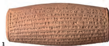
3. Clay cylinder in cuneiform writing with the name of Assyrian king Ashurbanipal, Babylon, 7 th c. BC, Ø 17.6 cm.