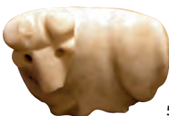
5. Banded calcite ram-shaped stamp seal, Tell Agrab, Uruk Period (ca. 4000 – 3100 BC).

Cylinder seals: May have cuneiform inscriptions. Size: 2-7 x Ø 1-3 cm. [7]