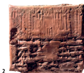
2. Clay tablet with seal impression depicting two goats in front of a building, Ashur, 12 th – 11 th c. BC, 6.5 x 6.7 cm.