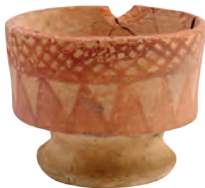
28. Calcite alabaster vessel, Southwestern Arabia, ca. mid-1 st millennium BC, 5.25 cm, diameter of base 7.1 cm.