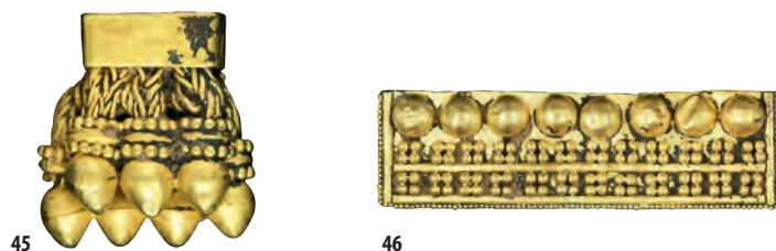
45. Gold pendant, Yemen (Marib ?), 1.42 x 1.31 cm.

Earrings, pendants, rings, bracelets, necklaces and anklets made of gold or silver; can be beaded.