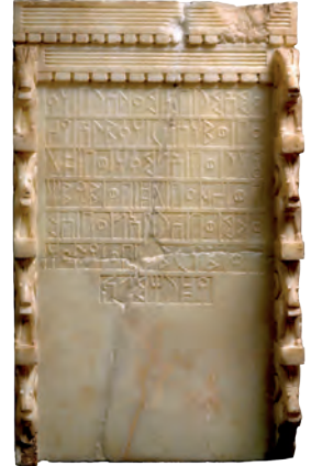
26. Limestone libation table, Yemen (Marib), 10 x 123.5 x 69 cm.