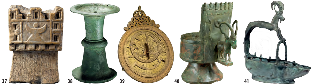
37. Limestone incense burner, South Arabia, late 3 rd c. AD, 25.5 x 18 x 16 cm.

Incense burners, astrolabes and lamps: Made of metal, stone or clay, of various shapes and forms.