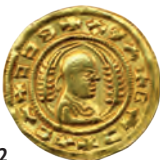
32. Gold coin, Yemen (North of Aden), ca. AD 450-500, Ø 0.17 cm.