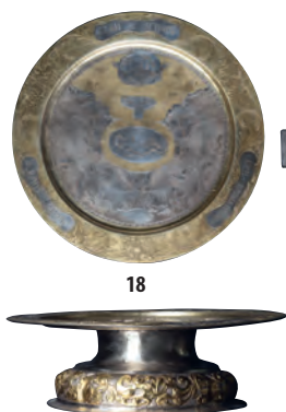
18. Discos (silver, engraving, minting, gilding), Kyiv region, early 18 th c. AD, 8.8 x 28.8 x 20.7 cm.

Service artefacts and sculptures; silver and wood; engraving, embossing, gilding and/or silvering.