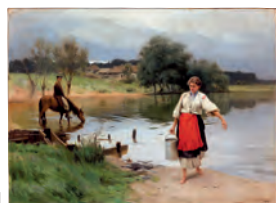
11. "On the river", oil on canvas, by Mykola Pymonenko, Ukrainian arts, late 19 th -early 20 th c. AD, 80.5 x 109 cm.