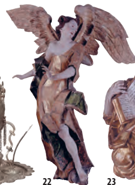
22. Angel (wood, oil, gilding), Ternopil region, 18 th c. AD, 131 x 60 x 44 cm.