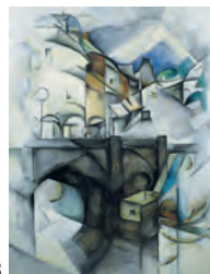
13. "Bridge Sevres", oil on canvas, by Oleksandra Ekster, Ukrainian avant-garde, 1912, 145 x 115 cm.