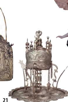
21. Bakhurst [cassolette], silver, Crimea, 18 th -19 th c. AD, 28 x Ø 25.3 cm.