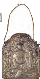
20. Khatases [decorations for the Torah], (silver, repoussé and chasing), Crimea, 19 th c. AD.