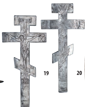
19. Altar Cross (silver, embossing, engraving), Cherkasy region, end of 17 th c. AD, 37.1 x 18.3 x 0.9 cm.