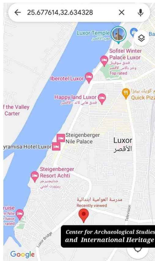
Location of the Center for Archaeological Studies and International Heritage in Luxor