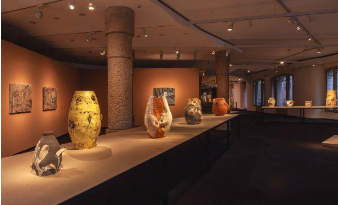
Miquel Barceló exhibition at Fundació Catalunya La Pedrera in Barcelona