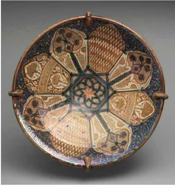
Pottery Bowl / Cuenco, Manises, ca. 1370. Tin-glazed earthenware with cobalt and luster decoration / loza vitriada al estaño con cobalto y lustre. Diam. 45.7 cm. Hispanic Society Museum & Library, New York.