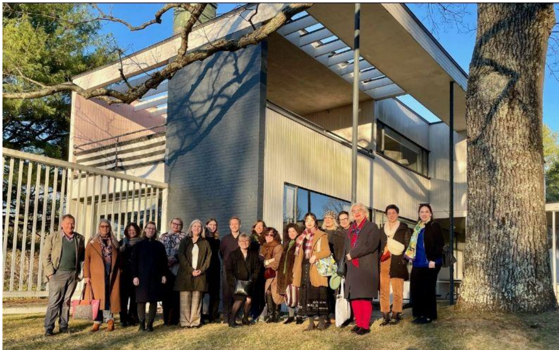
A visit to the Gropius House, home of Walter and Ise Gropius, Lincoln, MA, a property of Historic New England .

Our online series ICOM–DESIGN Talks (formerly ICDAD Talks) feature presentations on significant exhibitions or projects related to decorative arts and design by curators and specialists around the world. If you have an exhibition project or other topic that you think might be of interest to ICOM–DESIGN members, feel free to contact us at secretary.design@icom.museum .