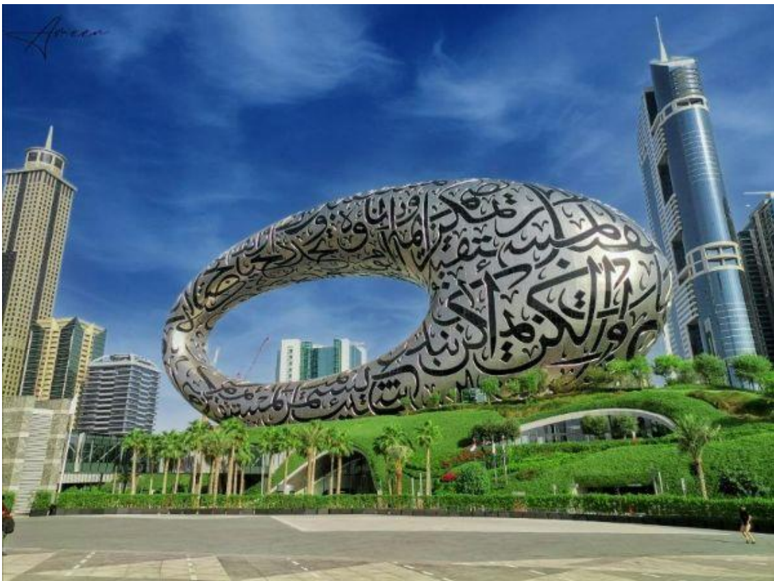
Museum of the Future, Dubai

Despite the prominence of the word DESIGN in our name, our committee continues to uphold its broad purview, encompassing decorative and applied arts—as well as design—across all mediums, from ancient to contemporary, including such topics as product design, the experiences and stories behind objects, interior spaces, historical reconstitution, conservation and exhibition, craftsmanship and techniques, future preservation, and more.