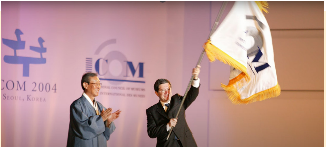
Figure 1 2004 ICOM Seoul General Conference.