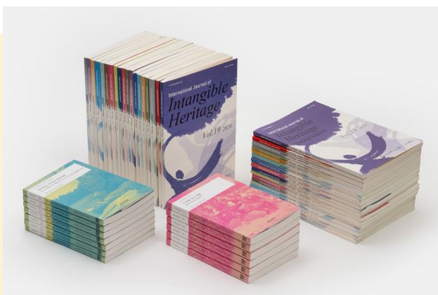
Figure 4 International Journal of Intangible Heritage .