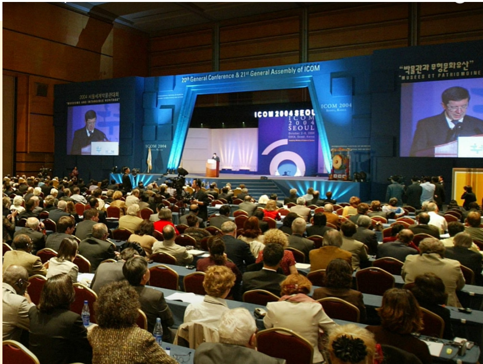
Figure 3 2004 ICOM Seoul General Conference.

Although the limitations and challenges of curating such exhibitions remain a central issue, it was noted that new forms of documentation—such as digital video—now make it possible to present intangible heritage in museum contexts.