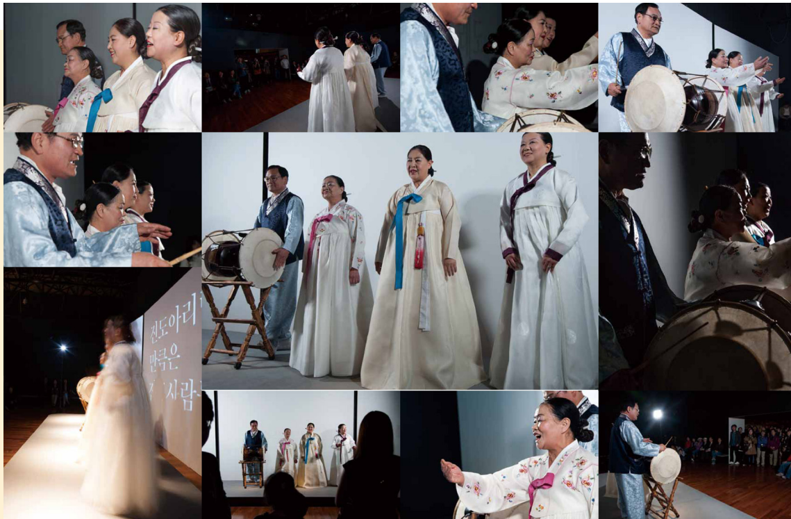
Figure 5 Performance accompanying the special exhibition Arirang at the National Folk Museum of Korea.

shaped through engagement with intangible heritage can function as a museum. We are entering an era of intangible heritage and intangible museums. Exhibitions of intangible heritage that emerge through interaction with contemporary society and diverse contexts are, in themselves, becoming intangible heritage. This represents the realization—within the museum—of the spirit of UNESCO and ICOM: a commitment to peace and prosperity through culture. And it all began with the ICOM General Conference held in Seoul.